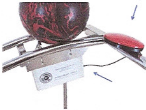
The possibowl is operated by simply plugging a switch into one of the two 1/8" mono jacks, turn on the power, push the switch and release the ball.

A Poss-I-bowl device and ramp will be used. Bring your own switch to Diablo Lanes in Concord: